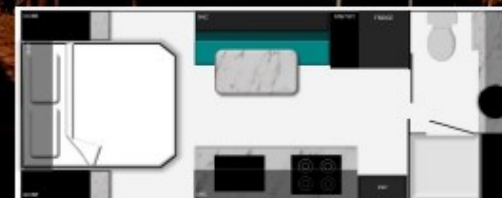
EAST REAR DOOR